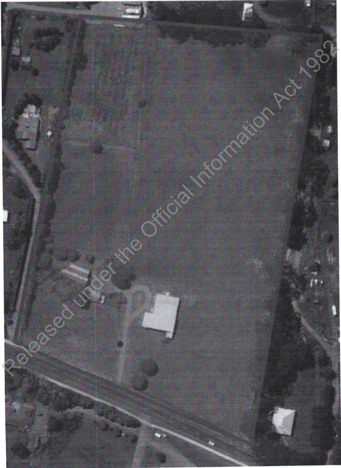
Figure 1: Map Showing the area of 344 Waipapa Road, Kerikeri for RHF Limited's Licence to Occupy