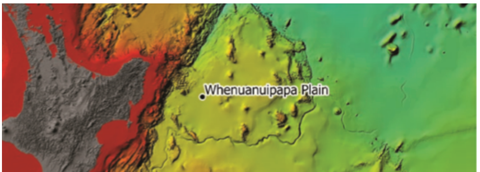
Whenuaui papa Plain - kōrero inenga moana nā NIWA

Whārangi tuarā: Tamatea - Mahi Toi nā Cliff Whiting, manatārua Ngā Pou Taunaha