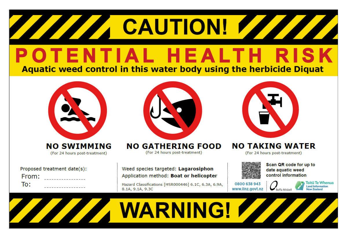
Figure 1. An example warning sign that will be erected at each spray site.

Warning signage is erected at each spray site prior to application and is removed once the 24hour stand down period for swimming, fishing and taking water has elapsed.