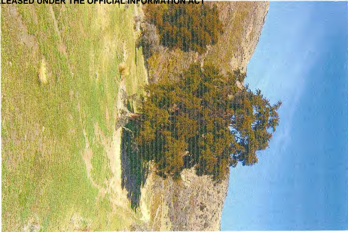
Photo # (3) A very old kanuka - could be up to 80 or more years old