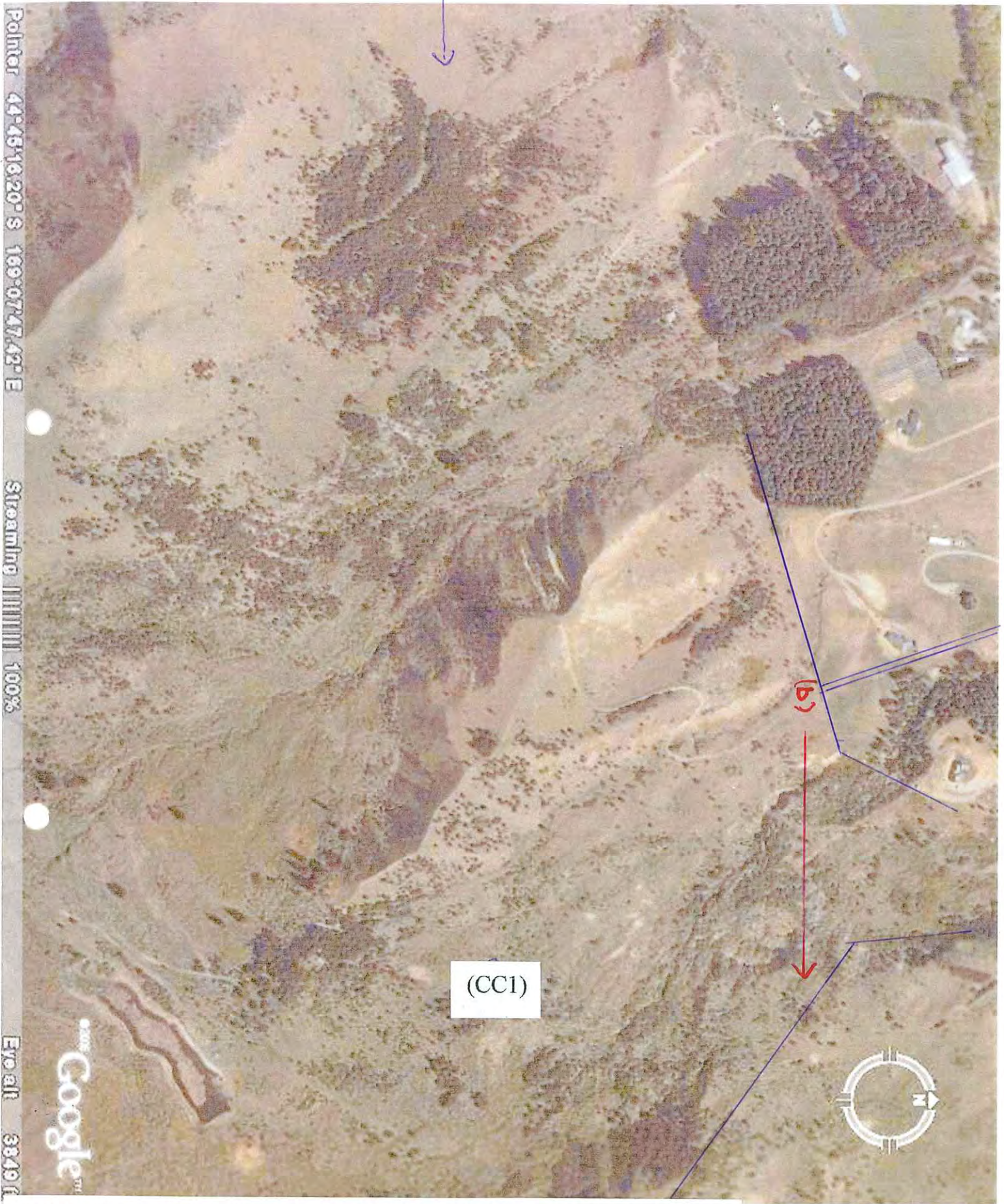
Photo # 1. This aerial photo shows the legal road coming up from Mt Barker Road to point (b) on the designation map. It also shows the only sensible route across the gulch to reach the boundary fence. The proposed route following the fence around the bottom of the gulch is not at all reasonable. Also there is very little room on the proposed 10m easement between the fence and the gulch. However it will require a cutting to be made to get into and out of the gulch, but if machinery is being used to form a track up the boundary fence on the 150m strip this should be no problem. (See also the attached plan)