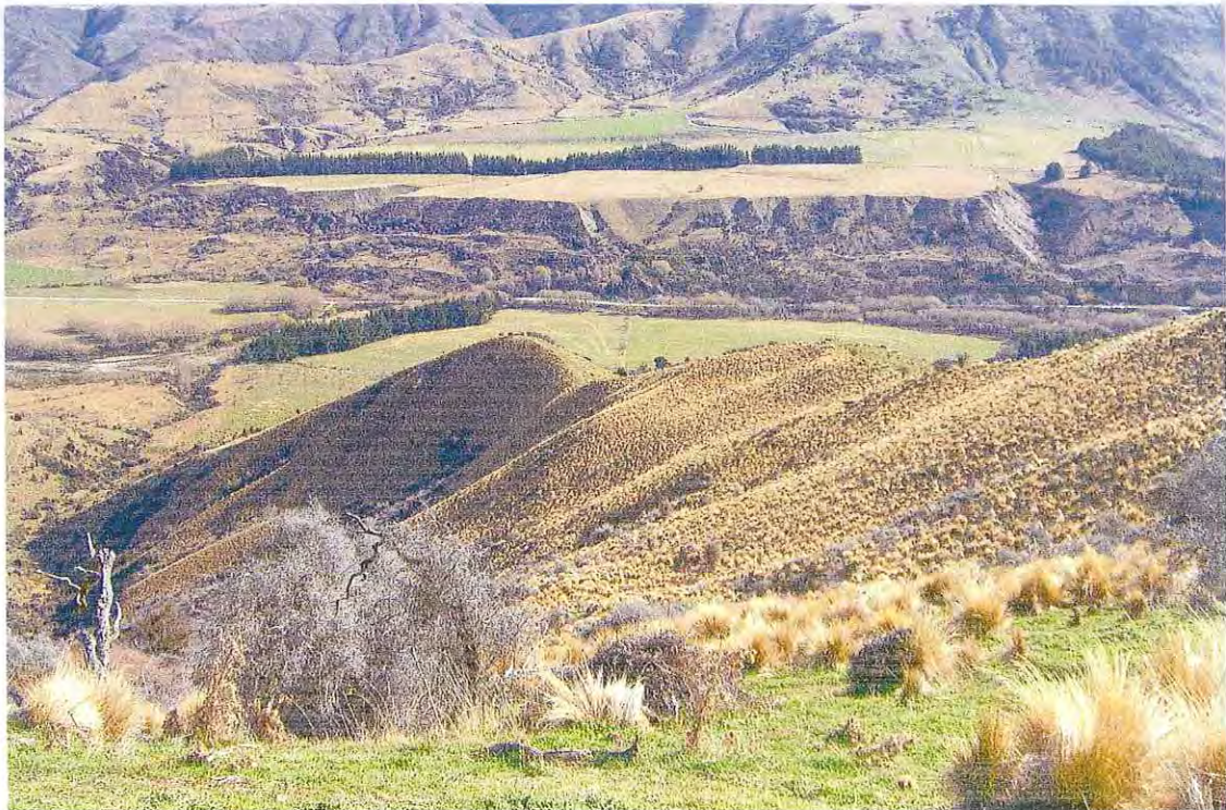
Photo # (6) Shows short tussock grasslands on lee side of lower spurs