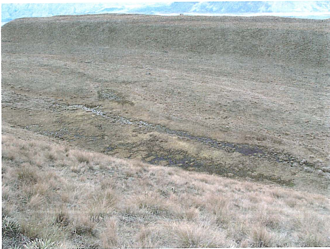
Photo 10 Wetland at base of eastern slopes of High Terrace at J36 369205. The moraine hollows contain a series of wetlands such as this which are not described in Conservation Resources Report. The area has SIVs deserving protection as part of CA3.