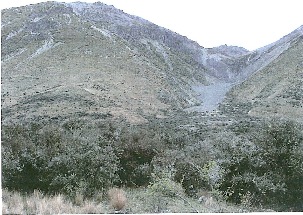
Photo 5 Looking into Sandy's Basin from farm track, eastern faces Black Mountain Range. Fencing here is likely and scar the landscape and farm development will degrade shrublands and tussock. Extend CA2 to include all of CC3.