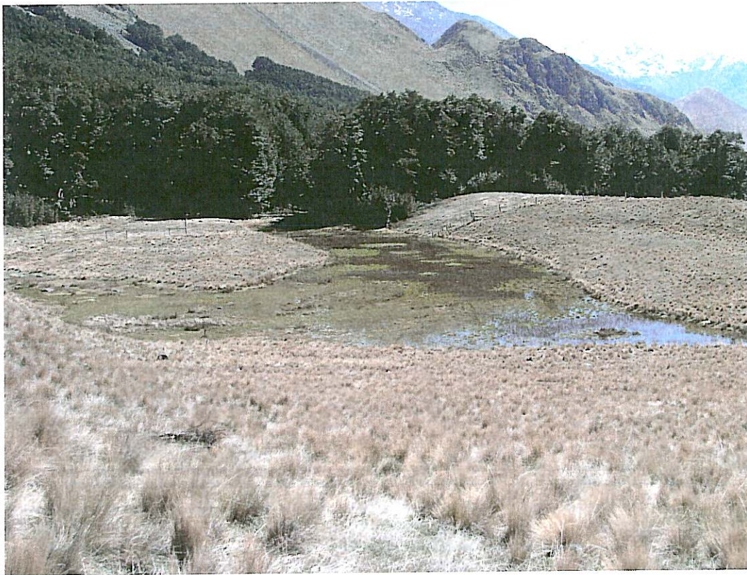
Photo 8 Wetland at southern edge of Bulter Downs beech forest. Proposed repaired Q-R fenceline cuts across wetland. Extend CA3 and fence to include wetland as conservation land and protect from stock.