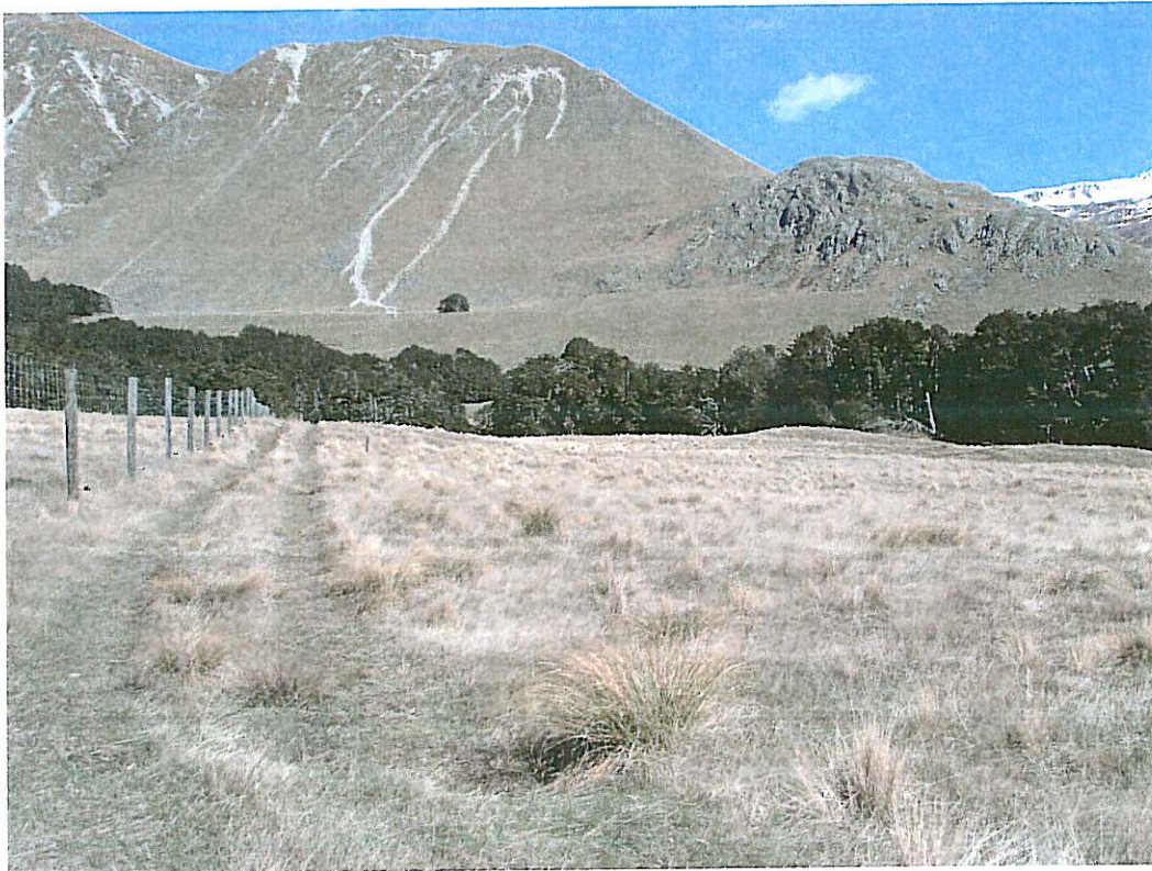
Photo 6 Tongues of Butler Downs mountain beech forest proposed for freeholding. Looking east along deer fence. Extend CA3 to include all of the forest and a buffer area for regeneration.