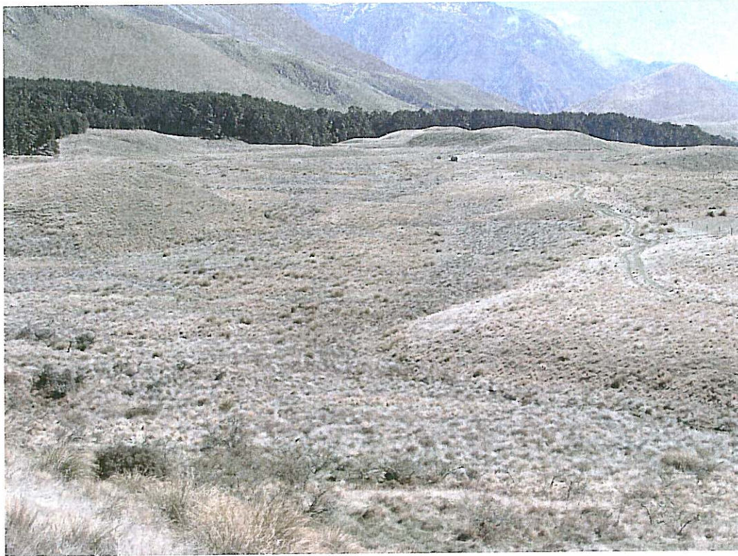
Photo 7 Red tussock and Schoenus wetland between eastern edge of Bulter Downs forest and farm track from Scour Stream to High Terrace. Extend CA3 to include wetland. Photo is looking north.